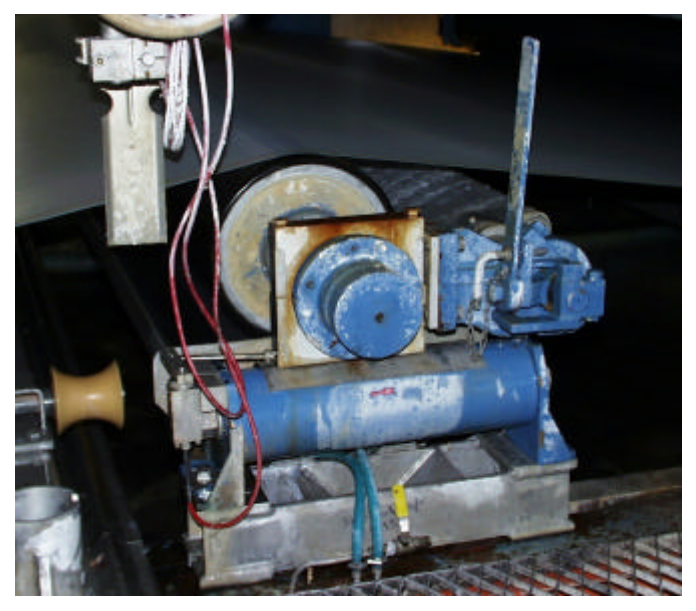
III. 3: Wire guide with ElectroPalm in the forming wire of the PM 5

In 1998 an ElectroPalm with programmable oscillation was installed on the forming wire guide. The oscillation amplitude of the longitudinal filter is 15 mm with a relatively short cycle time of 15 min.