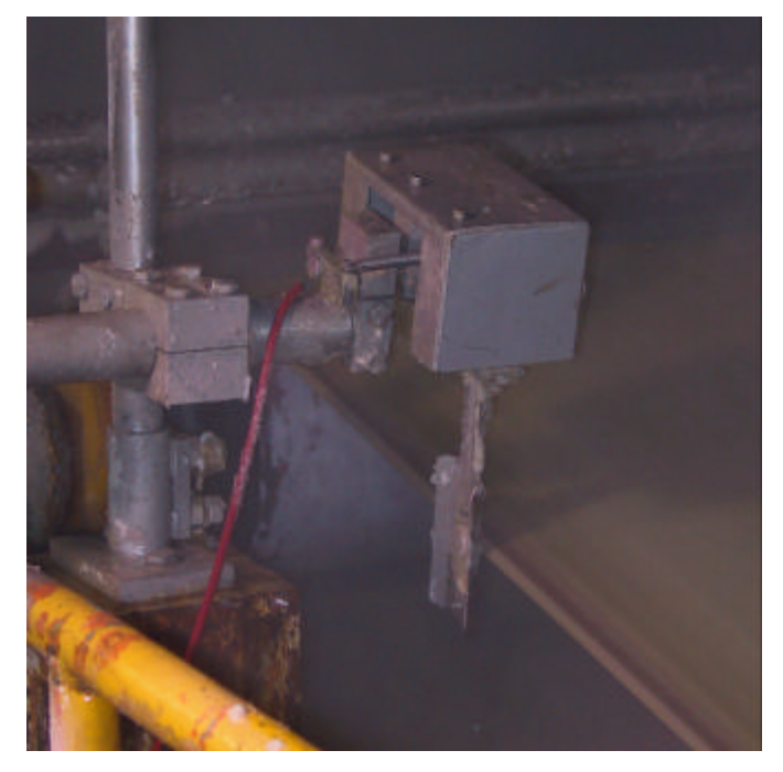
III. 1.: ElectroPalm in the felt of a crescent former with oscillation to avoid damage caused by edge trimming.

Erhardt + Leimer GmbH has developed the ElectroPalm electro-mechanical edge sensor. Here, an oscillation of the sensor zero position overrides the guiding signal.